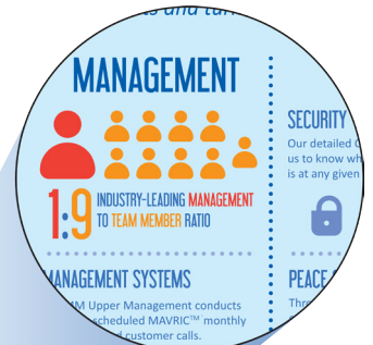
MMMM Value Proposition Infographic

MMMM will continually examine our processes and procedures for efficiencies and improvements for your benefit; however, our core philosophy will always center on the fact that we deliver what we say we will and MORE.