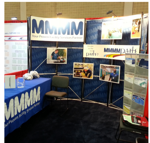
MMMM's Booth setup at IFMA WWP 2012